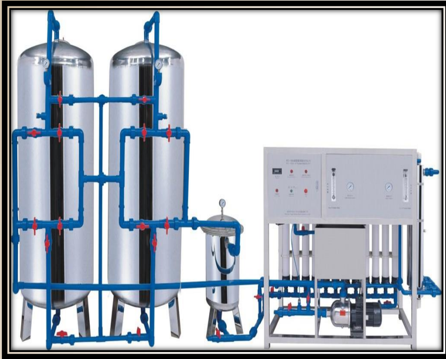
WATER PURIFIED MACHINE