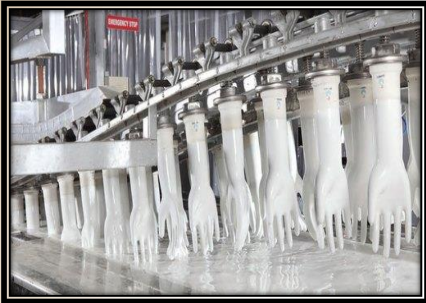
GLOVE DIPPING MACHINE